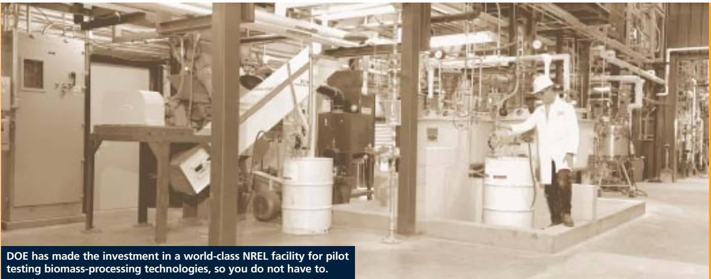
DOE has made the investment in a world-class NREL facility for pilot testing biomass-processing technologies, so you do not have to.