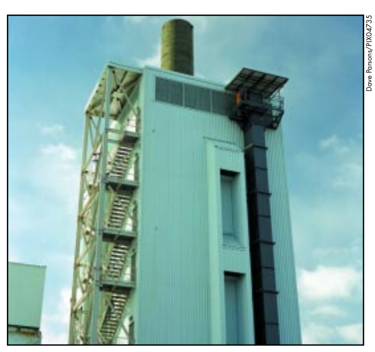
This country's first demonstration of a biomass gasifier—which supplies clean, renewable fuel from biomass to a utility power plant—is set to go on-line.

The Burlington Electric Department, a city utility, hosts the gasifier demonstration at its Joseph C. McNeil woodpowered electric generating facility. The demonstration project was put together by a unique partnership that includes the host, the U.S. Department of Energy, Battelle, the National Renewable Energy Laboratory (NREL), and Future Energy Resources Corporation (FERCO), a private firm committed to developing and commercializing the gasifier.