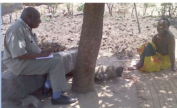
Zambian woman describes benefits of solar electrification of her home to inform development impact assessment.

Beginning in 2014, the Zambian Ministry of Lands, Natural Resources and Environmental Protection and U.S. Agency for International Development (USAID), via the Enhancing Capacity for Low Emission Development Strategies (EC-LEDS) program, partnered to build capacity among local technical institutions and stakeholders to assess and communicate development impacts of LEDS actions. The partnership commenced with workshops and training sessions with the Zambian Center for Energy, Environment and Engineering (CEEZ) to champion a development impact assessment process in Zambia.