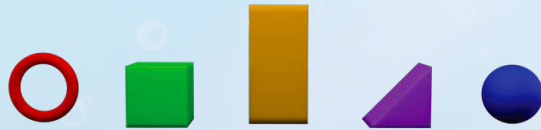
Pictorial representations of DEECs

Individual Distributed Embedded Energy Converters (DEECs) are the smallest, most fundamental unit of the DEEC-Tec hierarchy; often having characteristic lengths of less than a few centimeters. An individual DEEC has two foundational roles: (1) being an energy transducer and (2) being a structural mechanism. As an energy transducer, an individual DEEC converts some form of inputted energy into another type of energy, such as electricity or fluidic pressure, via the use of a physical phenomenon that could (for example) range from variable capacitance to piezoelectric. As a structural mechanism, an individual DEEC enables its connection and linkage to other DEECs—thereby facilitating the creation of DEEC-Tec metamaterials. Below are five simple pictorial representations of DEECs. They are an illustrative means to show that individual DEECs can come in different shapes and sizes with, correspondingly, different properties and characteristics.