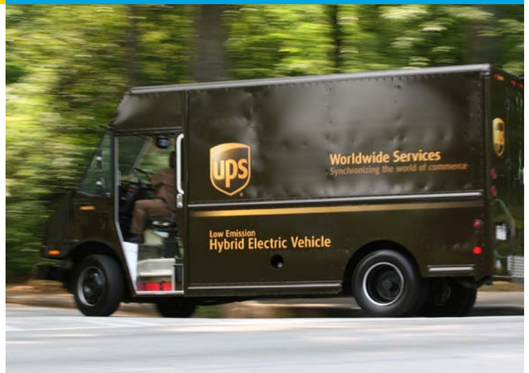
UPS operates 381 hybrid-electric delivery vans nationwide.

This project is part of a series of evaluations performed by NREL's Fleet Test and Evaluation Team for the U.S. Department of Energy's Advanced Vehicle Testing Activity (AVTA). AVTA bridges the gap between research and development and the commercial availability of advanced vehicle technologies that reduce petroleum use and improve air quality in the United States. The main objective of AVTA projects is to provide comprehensive, unbiased evaluations of advanced vehicle technologies in commercial use. Data are collected and analyzed for operation, maintenance, performance, costs, and emissions characteristics of advanced-technology fleets and comparable conventional-technology fleets operating at the same site. AVTA evaluations enable fleet owners and operators to make informed vehicle-purchasing decisions.