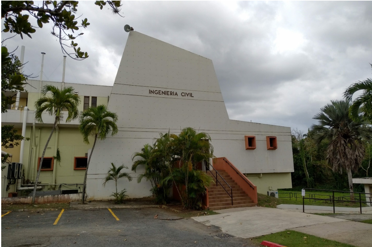
Figure 9: Department of Civil Engineering and Surveying at UPRM Mayaguez where workshop was held on March 22, 2019 (above), and directional signage (at right)