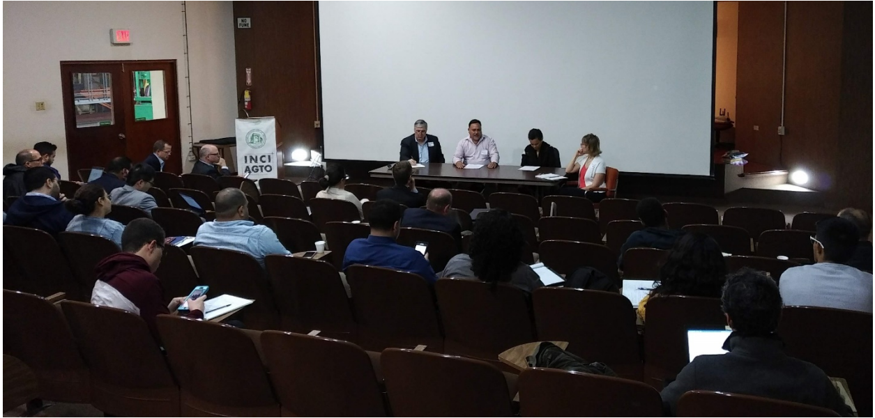
Figure 6: Panel discussion during morning session in Mayaguez on March 22, 2019