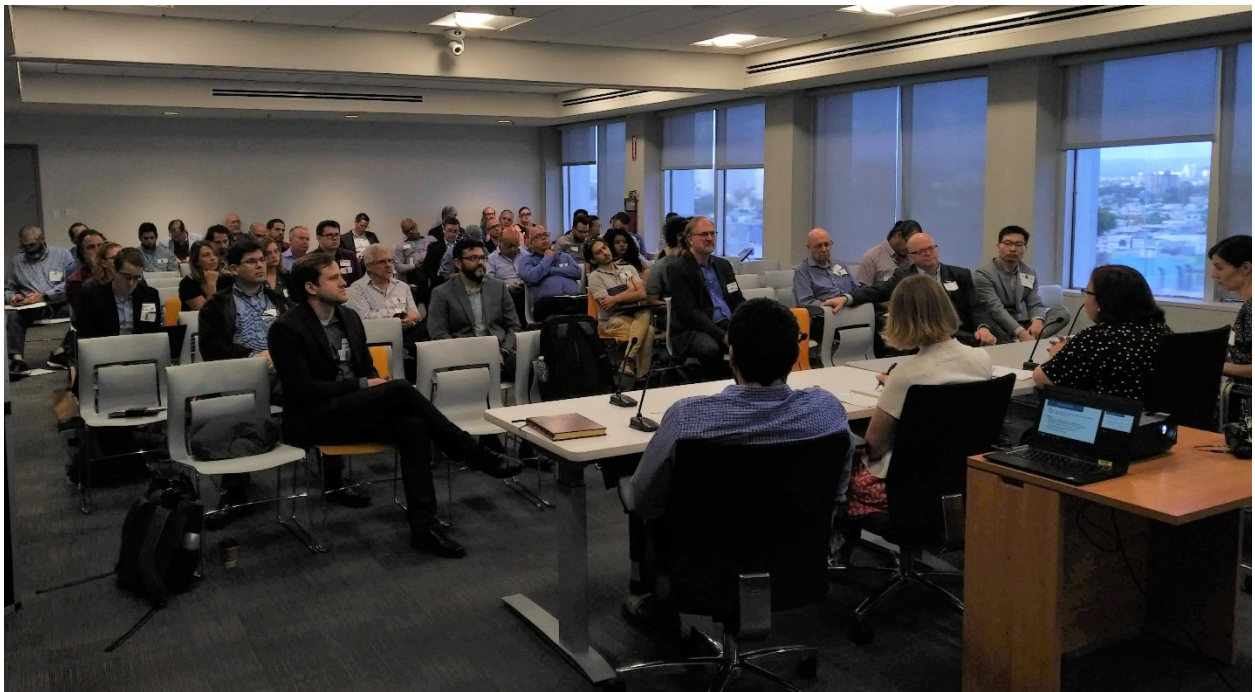
Figure 2: Panel discussion during morning session in San Juan, March 18, 2019 (top and bottom)