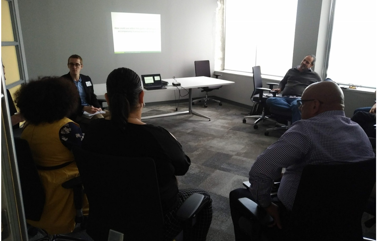
Figure 5: Afternoon session on energy efficiency with Adam Hasz of DOE in San Juan on March 18, 2019