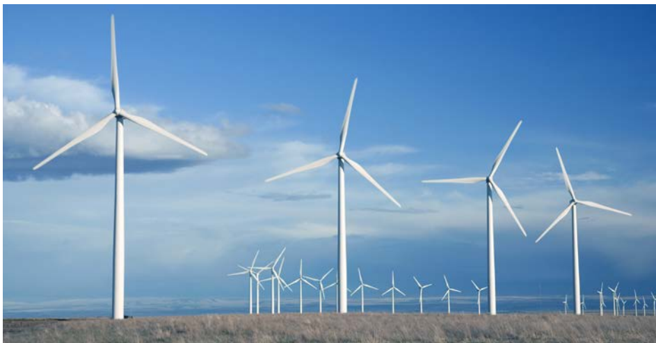
Figure 1: Procuring flexibility becomes increasingly important in systems with significant grid-connected wind and solar energy. Photo from Iberdrola Renewables, Inc., 15180