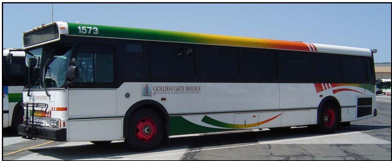
Figure B-2 GGT diesel bus

The District is unique among Bay Area transit operations because it receives no support from local sales tax measures or dedicated general funds. The District does not have the authority to levy taxes and relies on surplus bridge toll revenue as its only local support for the District's transbay transit services. Currently, GGT bus and ferry operations are funded approximately 50% by surplus Golden Gate Bridge tolls and 30% by transit fares. The remaining funds are covered by other sources, including federal, state, and local subsidies, and from advertising and property equipment rental revenues.