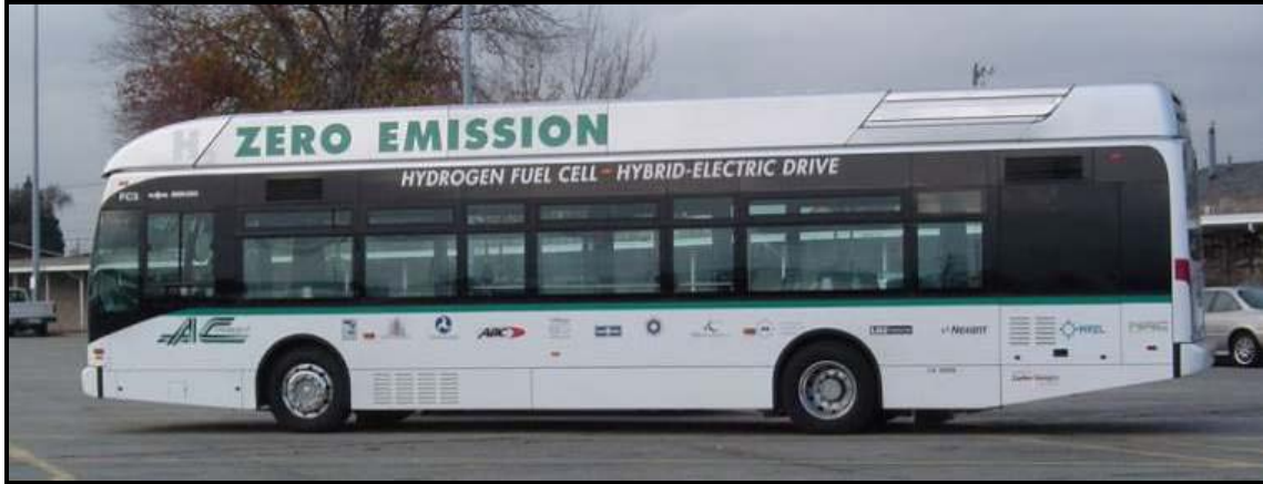
Figure C-1. AC Transit fuel cell bus