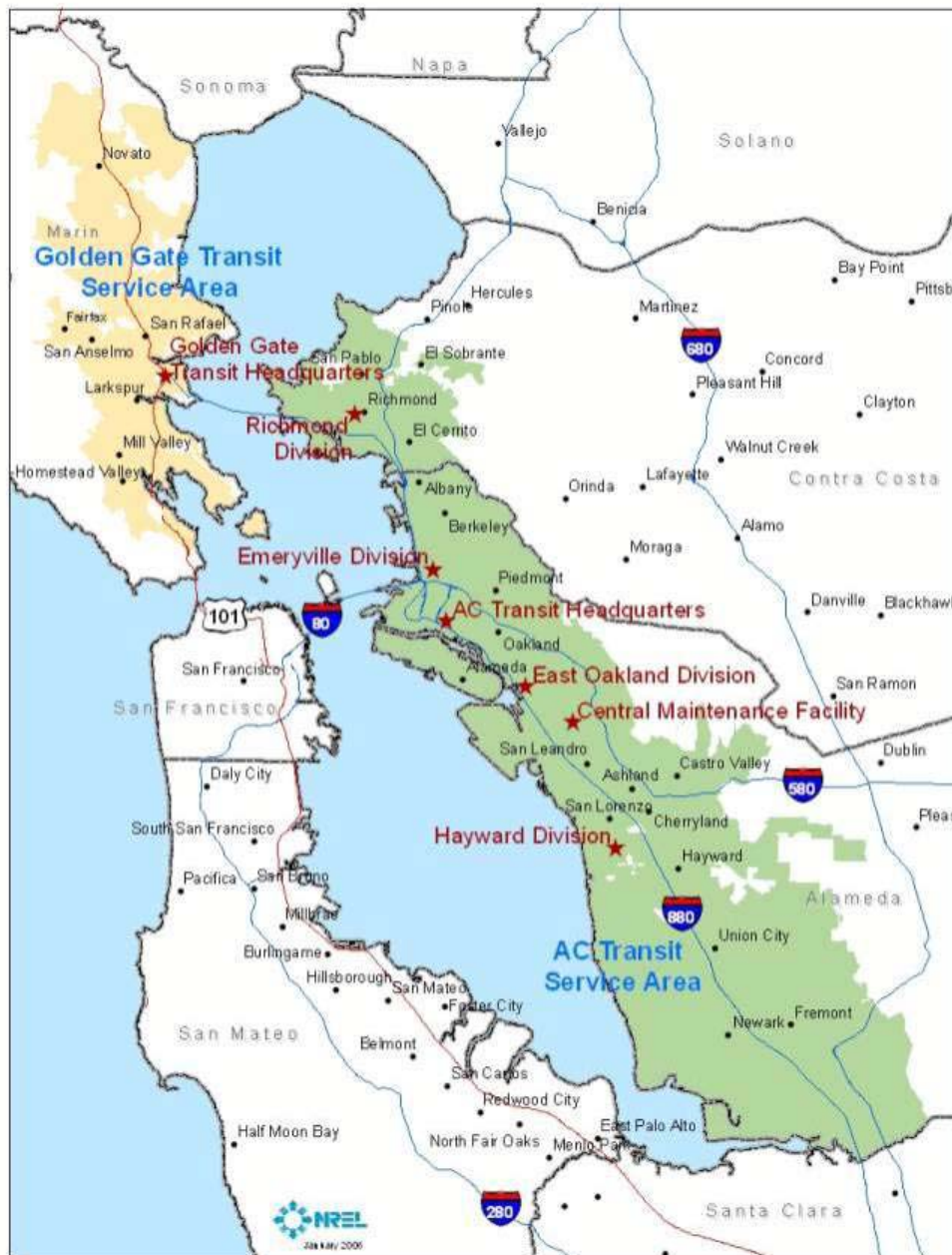
Figure B-1. AC Transit and GGT operating area in California

The deadline for choosing one of these compliance paths was later in 2000. AC Transit and GGT chose the diesel path. AC Transit reported that it did not choose the alternative fuel path because of concerns about reliability and capital costs for operating on an alternative fuel such as CNG. Fleets choosing the diesel path were required to reduce their average emissions through methods such as purchasing the cleanest diesel engines and retrofitting existing diesel engines with emissions control devices such as diesel particulate filters (DPFs). All California transit agencies with 200 or more buses (including AC Transit and GGT) choosing the diesel path were required to demonstrate and eventually procure ZEBs at a rate of 15% of all new bus purchases starting in model year 2011.