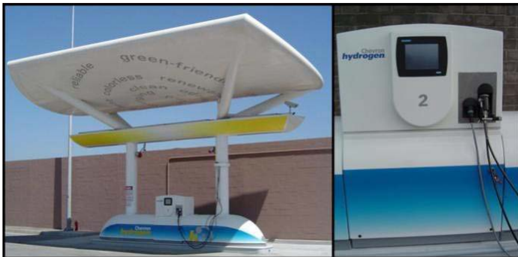
Figure D-1. Dispenser at Chevron—AC Transit Energy Station

system connections monitor the tank-fill status and provide an appropriate fill at 5,000 psi. The dispensing system is designed to enable simultaneous fills for two buses (or light-duty FCVs). Figure D-1 shows the hydrogen fueling dispensers at the station. AC Transit's agreement with Chevron includes all operation and maintenance of the station for two years.