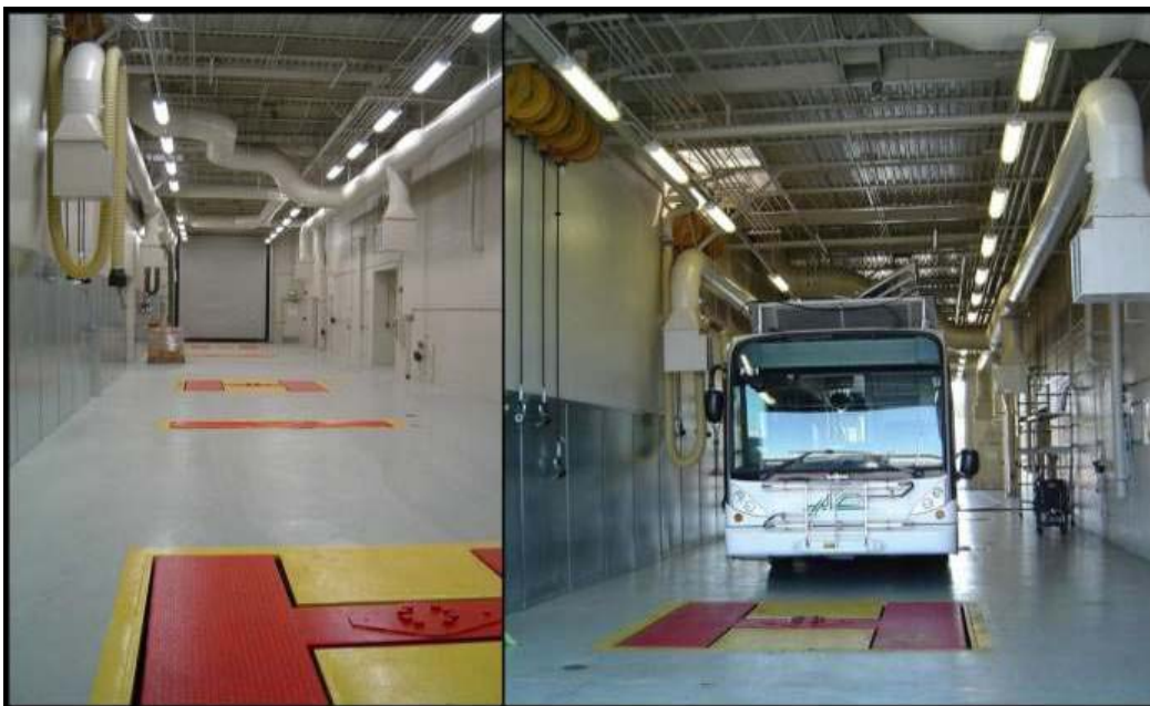
Figure D-3. Modified maintenance bay at AC Transit East Oakland Division

AC Transit chose to modify an existing facility to enable staff to maintain the hydrogen-fueled buses safely. The required modifications (~$1.5 million) were completed, and the maintenance bay was cleared for use in January 2006. The selected bay was isolated from the rest of the facility by a firewall. There is space for servicing two buses at a time. Figure D-3 shows the bay with and without a fuel cell bus.