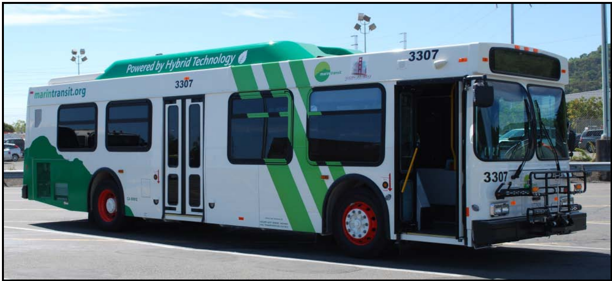
Figure B-3 GGT diesel hybrid bus

GGT also has a rigorous inspection schedule to ensure that the fleet operates at optimal levels with the lowest emissions. These steps enabled GGT to achieve a 97% reduction in PM levels from 1992 levels.