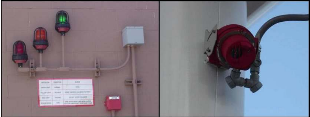
Figure D-2. Condition indicator lights (left) and hydrogen flame sensor (right) at the Chevron-AC Transit Hydrogen Energy Station