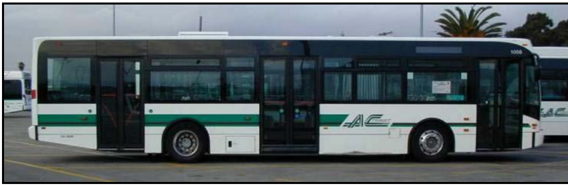
Figure C-2. Diesel bus at AC Transit

Table C-2 provides a description of some of the electric propulsion systems for the fuel cell buses. Note that the diesel buses are not a hybrid configuration and do not have regenerative braking or energy storage for the drive system.