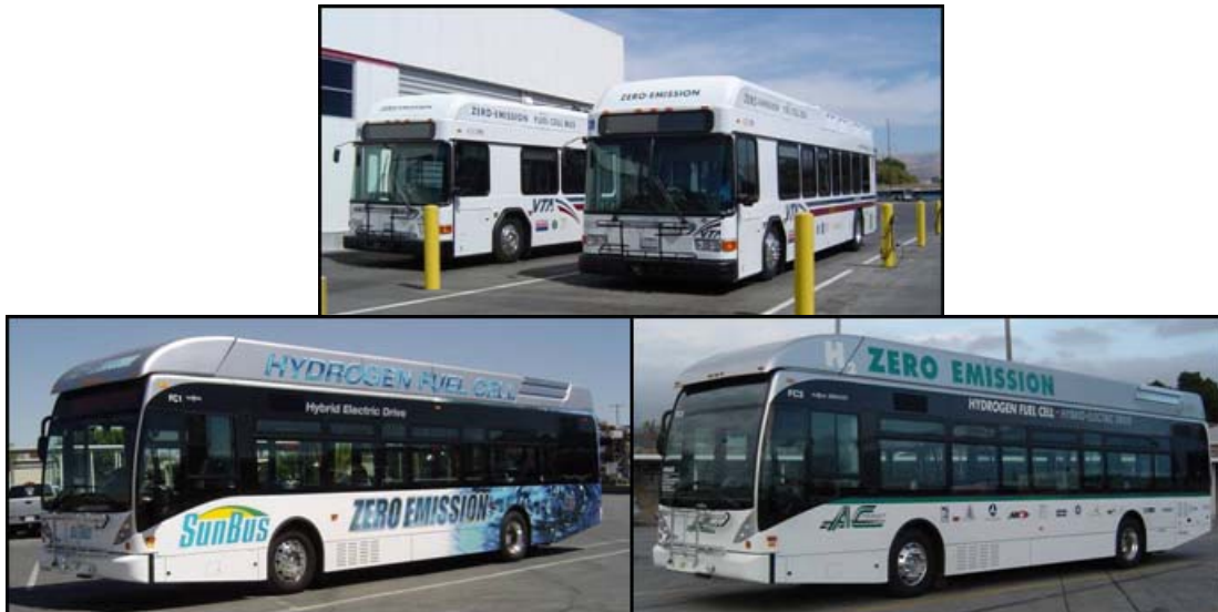
Figure 5. Fuel cell buses at VTA (top), SunLine (bottom left), and AC Transit (bottom right)

Figure 5 shows the three sites' fuel cell buses and several bus systems are described in Table 6. VTA's fuel cell buses are low-floor Gillig buses with Ballard fuel cell systems, and the SunLine and AC Transit fuel cell buses are of the same design and are from Van Hool and ISE Corporation with UTC Power fuel cells. The most important difference between the two designs is that the Van Hool/UTC Power bus incorporates a hybrid propulsion system with batteries for energy storage. The energy storage allows for regenerative braking, which has a significant impact on fuel economy. The purchase price of these buses is extremely high compared with that of a typical baseline transit bus. These fuel cell bus purchase prices include significant warranty coverage from the manufacturers including on-site staff from the fuel cell manufacturer and integrator, in the case of ISE Corp.