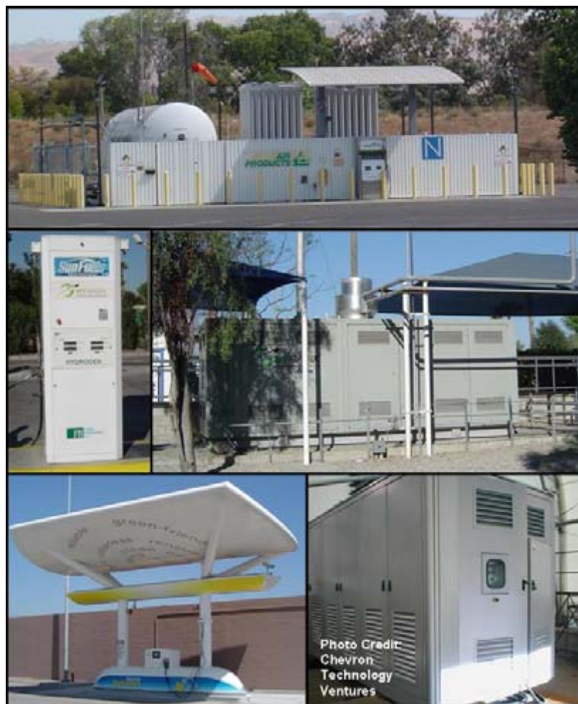
Figure 3. Hydrogen fueling stations at VTA (top), SunLine (middle), and AC Transit (bottom)