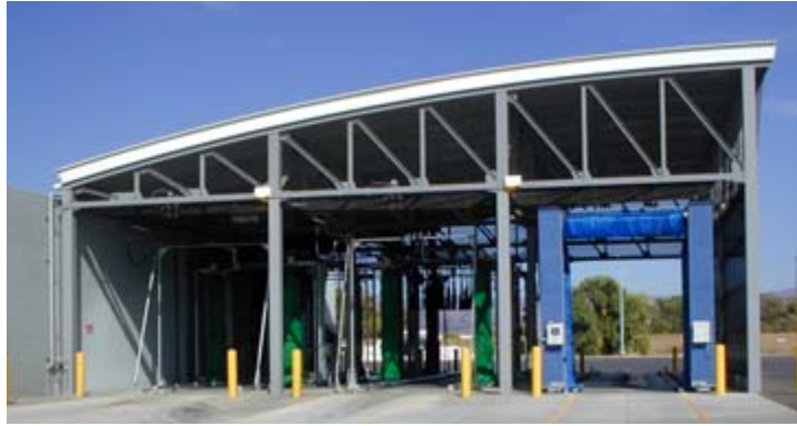
Figure 4. New bus wash facility at VTA