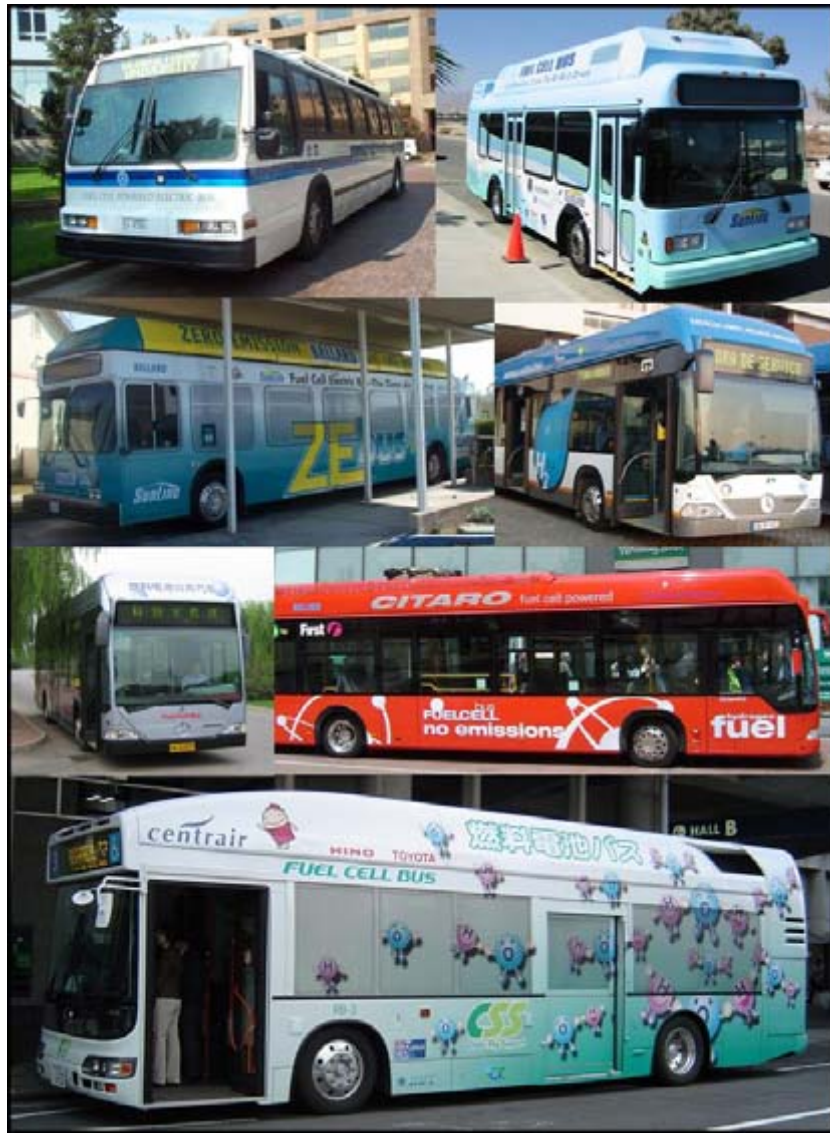
Figure 1. Photos from fuel cell bus demonstrations around the world

At the same time as these early fuel cell transit bus activities, transit agencies were participating in demonstrations to commercialize both compressed natural gas (CNG) and then diesel hybrid technologies for buses. These experiences supported the development of fuel cell transit buses by allowing participants to gain familiarity with the use of gaseous fuels in buses and the related infrastructure (and thus reducing the learning curve associated with hydrogen use) and electric hybrid propulsion (providing more familiarity with common components such as energy storage systems, motors, and computer controllers).