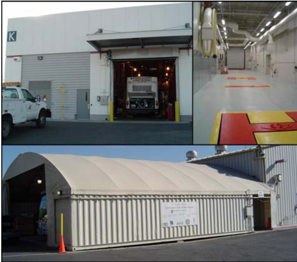
Figure 2. Hydrogen maintenance facilities at VTA (top left), AC Transit (top right), and SunLine (bottom)

unless it is defueled to 600 psi onboard. The cost of the modifications required was about $1.5 million, and the facility was cleared for operation in January 2006.